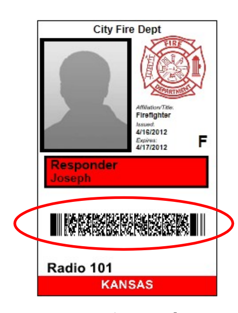
PDF-417 Barcode Original Version